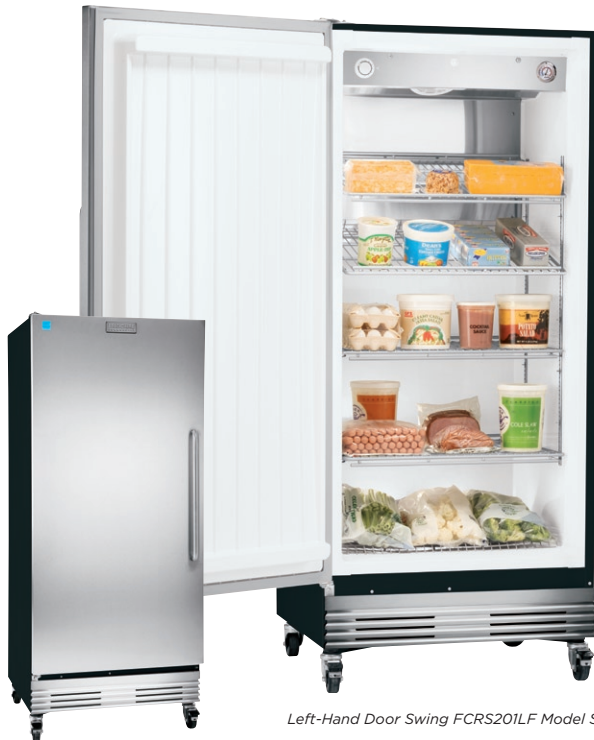
Left-Hand Door Swing FCRS201LF Model Shown

19.4 Cu. Ft. Commercial, Food Service Grade