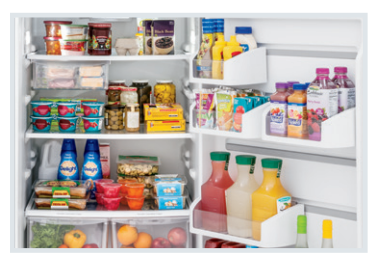
Over 100 Ways to Organize Our SpaceWise® Organization System offers 100 ways to organize with the Custom-Flex™ Door.<sup>1</sup>