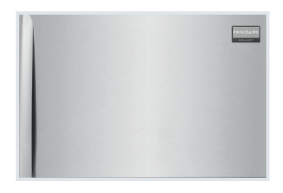
Smudge-Proof<sup>™</sup> Stainless Steel<sup>2</sup> Resists fingerprints and smudges so it's easy to clean.

The Custom-Flex™ Door comes with 4 different bins and accessories so you can customize your door. It includes one large, two medium, and one small bin.