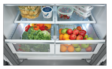
CrispSeal<sup>™</sup> CrispErs Humidity-controlled CrispSeal<sup>™</sup> crispers keep produce fresher longer, so you can waste less and save money.

Durable hardware and professional-grade design features including smoky door bins, door bin liners, edge-to-edge glass shelving with metallic trim, and a distinctive handle lend a high-quality look to your kitchen.