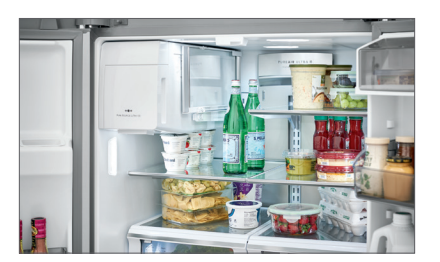
SpaceWise® Organization System Our SpaceWise® Organization System makes it easy to keep food organized and accessible, with a flip-up shelf to fit taller items with ease, plus adjustable door bins and shelves that offer storage capacity and flexibility.