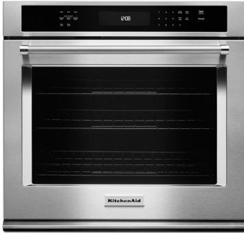
Stainless Steel KOSE500ESS