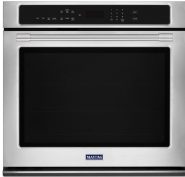
Fingerprint Resistant Stainless Steel MEW9530FZ